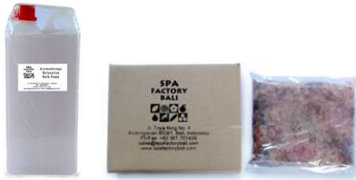
1 liter product &amp; 1 Kg product