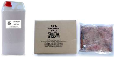
1 liter product &amp; 1 Kg product